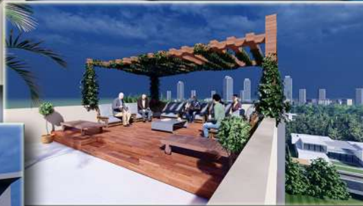
LANDSCAPED SITTING AREA AT ROOF