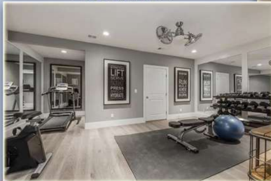
G Y M