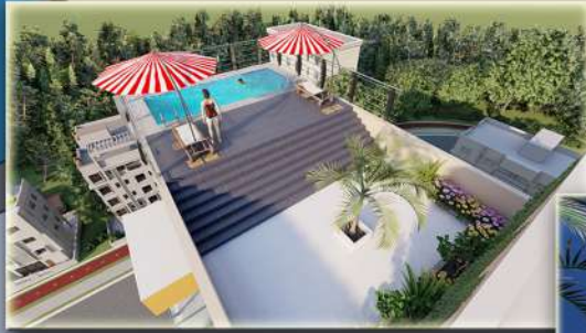
SWIMMING POOL AT ROOF