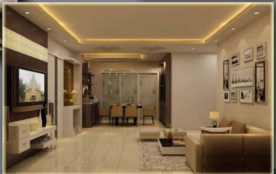
LIVING / DINING