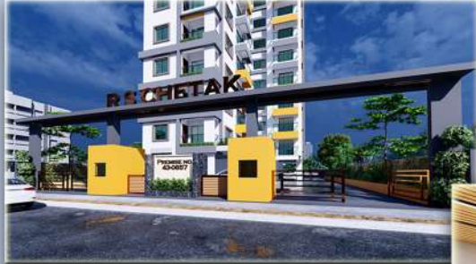
SECURITY KIOSK AT ENTRANCE